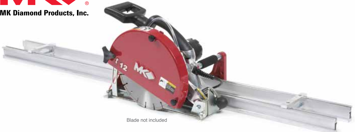
Blade not included

Saw shown with 72" rail. Second rail set included with saw extends cutting length to 130"