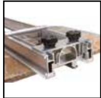
Heavy-duty hold-down clamps for use with slabs