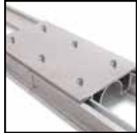
Aluminum track connector plate for extending the length of cut