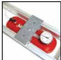
Optional: Vacuum clamp system secures the rail system to the work surface without mechanical clamps or fasteners

⚠ WARNING: Cancer and Reproductive Harm - www.p65warnings.ca.gov