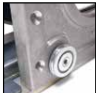
Steel Rollers for accurate tracking