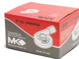
Carton Packed Part # 172366