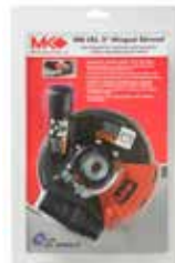
Clamshell Packed Part # 172360