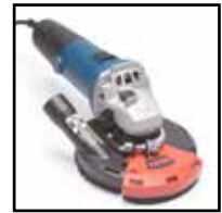
Installs easily on most 4", 4-1/2" and 5" grinders.

⚠ WARNING: Cancer and Reproductive Harm - www.p65warnings.ca.gov