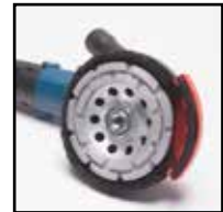
Designed for 4" - 5" diamond cup wheels