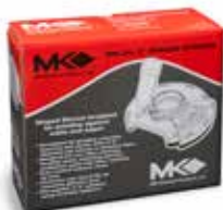
Carton Packed Part # 172366