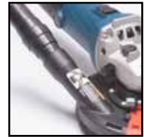
Easily attaches to vacuums or dust extractors