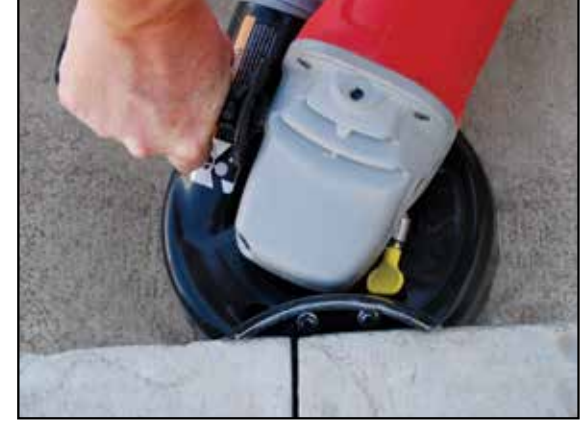
The IXL hinged shroud is designed for grinding against walls and edges.