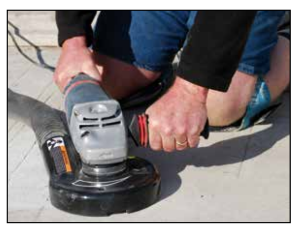
The IXL full shroud is designed for open areas.