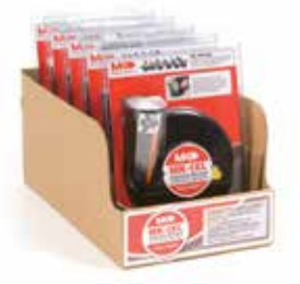
Sold in a Master Pack of 5 in a display tray.

WARNING: Cancer and Reproductive Harm - www.p65warnings.ca.gov