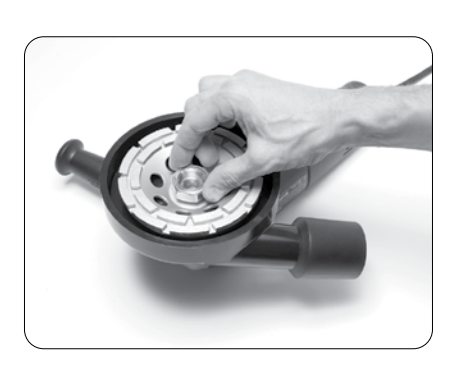
Screw hex nut onto cup nut assembly.