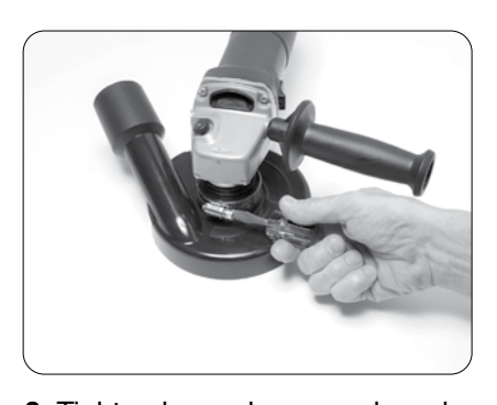
3. Tighten hose clamp so shroud is firmly attached to grinder.