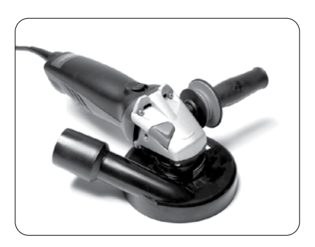
5. Shroud is now ready to be attached to vacuum.

NOTE: Cup Wheel should extend 1/16"-1/8" below bottom of shroud. Use washer(s) to achieve proper distance if needed. As cup wheel is worn use additional washer to achieve distance needed.