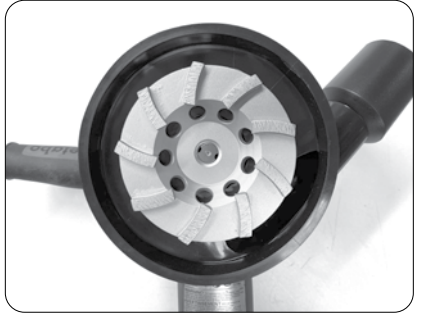
4. Attach cup wheel. Ensure cup wheel does not contact shroud.