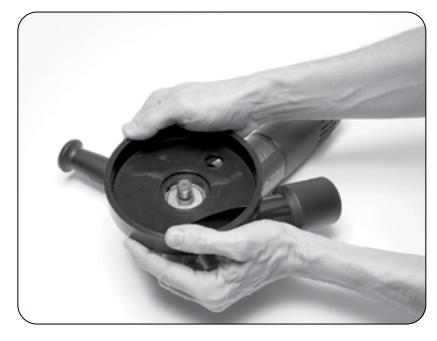
2. Press shroud on grinder.