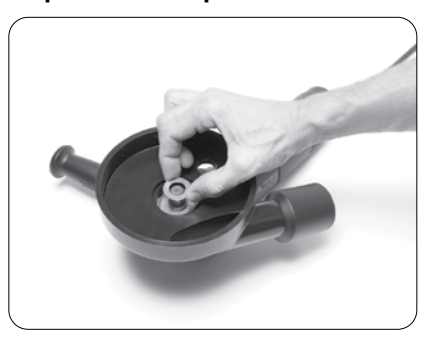
1. Small shim is for use with grinders that have a small shoulder.