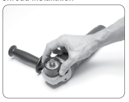
1. If grinder has a small throat, use collar so shroud fits tightly.