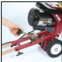
Wheel height is adjustable to provide ideal blade angle