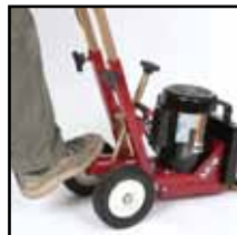
Kick plate for pivoting ease and a push-point for added force