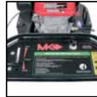
User friendly control panel

*Engine Power ratings are calculated by the individual engine manufacturer and the rating method may vary among engine manufacturers. MK Diamond Products makes no claim, representation or warranty as to the power rating of the engine on this equipment and disclaims any responsibility or liability of any kind whatsoever with respect to the accuracy or the engine power rating. Users are advised to consult the engine manufacturer's owners manual and website for specific information regarding the engine power rating.