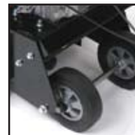
Two position wheel carriage