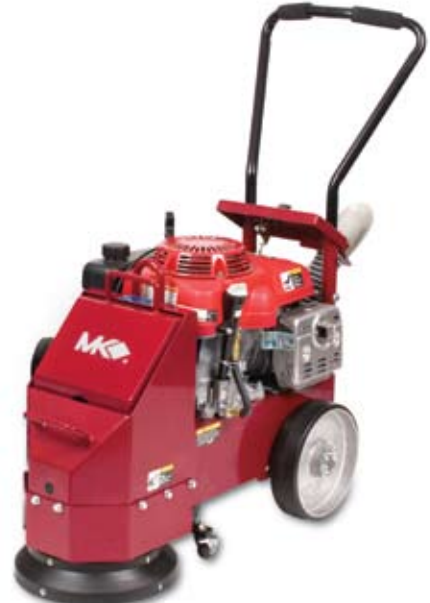
SDG-11 With Vacuum Shroud