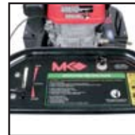
User friendly control panel

*Engine Power ratings are calculated by the individual engine manufacturer and the rating method may vary among engine manufacturers. MK Diamond Products makes no claim, representation or warranty as to the power rating of the engine on this equipment and disclaims any responsibility or liability of any kind whatsoever with respect to the accuracy or the engine power rating. Users are advised to consult the engine manufacturer's owners manual and website for specific information regarding the engine power rating.