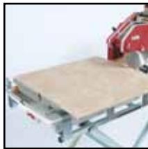
Large table accommodates 24" tile, diagonal 18" tile

Optional folding stand part # 168244, rolling stand part # 169243