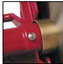
Locking blade shaft for easy blade removal