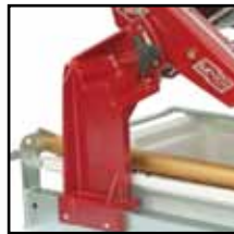
Multi-position motor post and cutting head for convenient cutting of various tile sizes