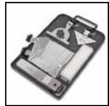
Optional Cutting Kit available, part # 155954