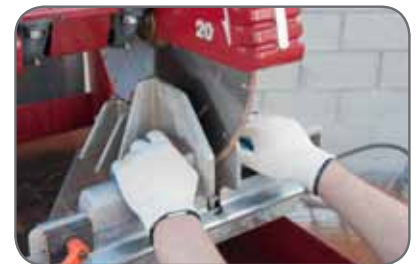
Hands are safely protected from blade.