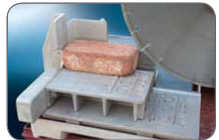
Both standard brick veneers and corner cuts can be made on the riser.