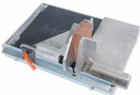
Higgins Jig for cutting veneer corners. (Part # 169548)