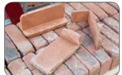
Cuts 2 x 8 right angle corners, paver corners and lintel corner.