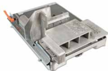
Higgins Jig with riser for cutting veneer flats. (Part # 170158)

The Higgins Jig increases safety, output and profitability. View the video at www.mkdiamond.com/higginsjig/