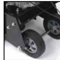
Two position wheel carriage