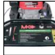
User friendly control panel