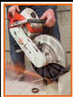
DUCTILE IRON & STEEL PIPES