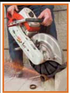
DUCTILE IRON & STEEL PIPES